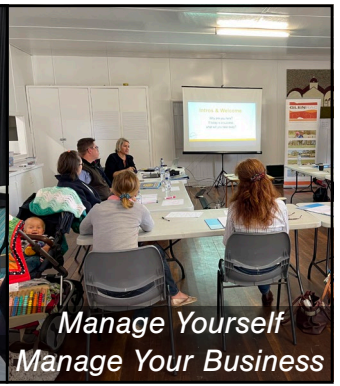
Manage Yourself Manage Your Business