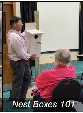
Nest Boxes 101