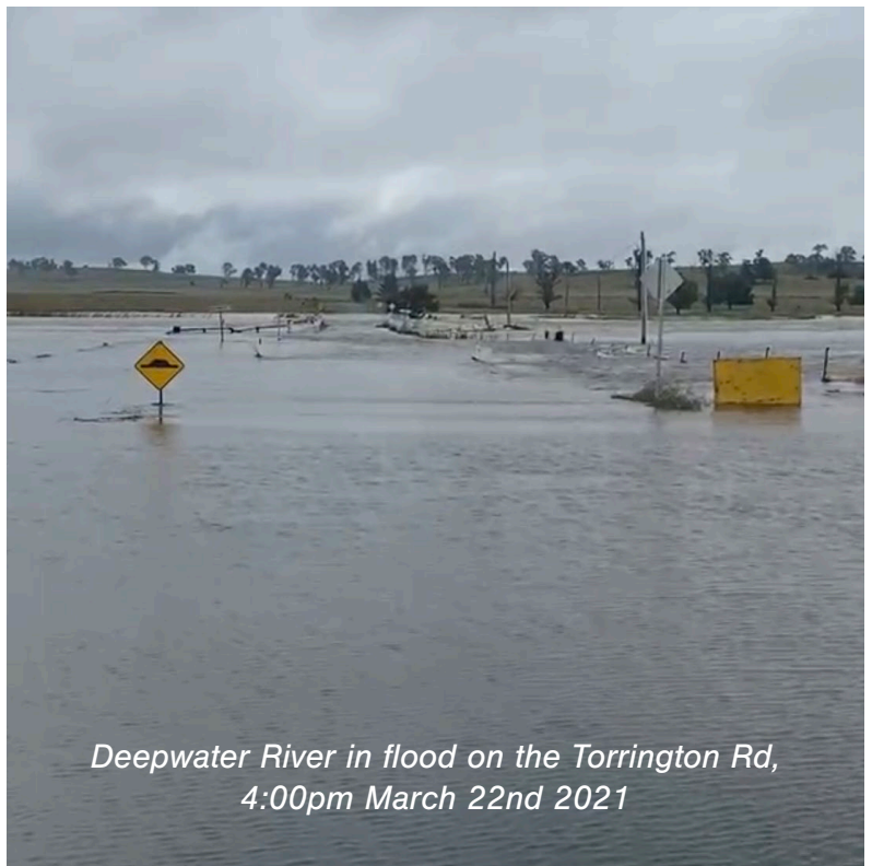
Deepwater River in flood on the Torrington Rd, 4:00pm March 22nd 2021

We are extremely grateful to all of our event partners and supporters, and everyone who helped to make the day such a great success. We would like to share this award with each of you. It's pretty amazing what small communities can pull off when they work together!