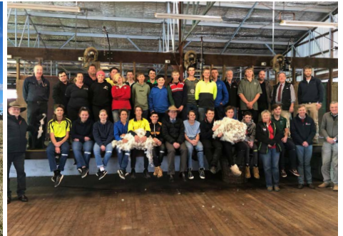
Some of GLENRAC's projects for this year, including the Winter Garden Weekend, Dundee Pasture Walk and 3 Day Wool Works Shearing School.

Financial year 2020-2021 has been enormous here at GLENRAC headquarters. It's time to pause, take a breath and reflect on the huge amount of achievements made this year, don't you think? Phew!