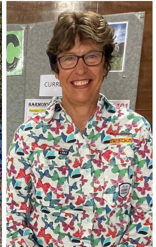
We love our Dolly's Dream butterfly shirts! Some of the GLENRAC team rocking the shirt on Do it for Dolly Day, 14th May 2021. It's never too late to change the culture around bullying.