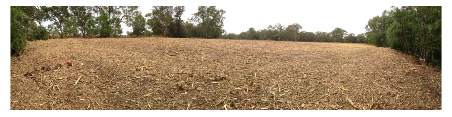
Figure 5. Site post mulching before follow up control works begin.