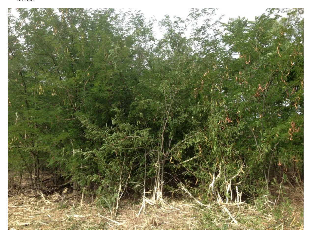
Figure 1. Honey Locust - Tree of Heaven mixed stand found on the flats

The site known as the 3-mile crossing, is crown land, and contained an impenetrable thicket of approximately 2 acres of Honey Locust, Tree of Heaven and feral peach. Partnership was sought with Inverell Shire Council and Trade & Investment – Crown Lands, who agreed that woody weed control at this site was critical in order to achieve control downstream. The site housed a very large seed bank on the Severn River, and failure to control the weed here, would have negated the efforts that landholders had put into controlling the weed on private lands.