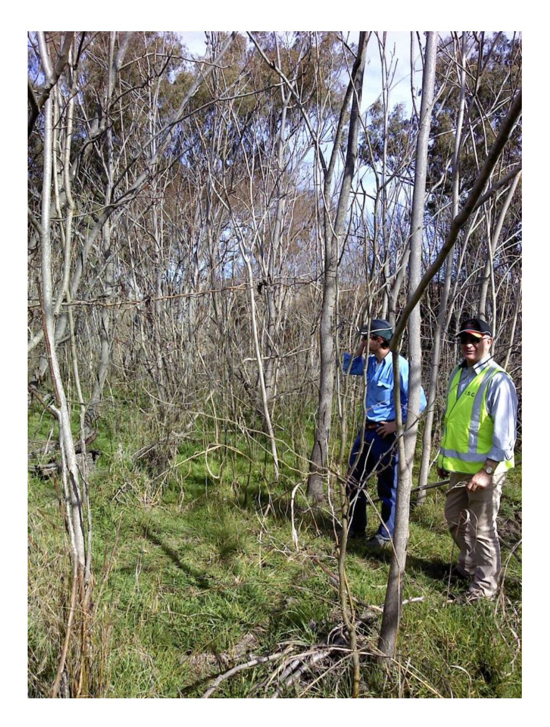
Figure 3. 2013 site inspection of Honey Locust - forming collaboration with Inverell Shire Council and Crown Lands