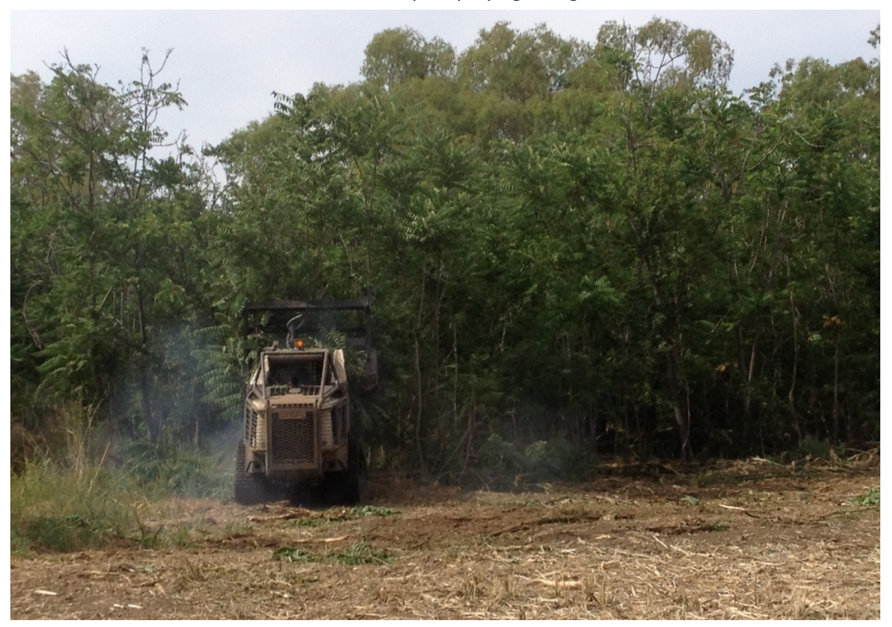
Figure 4. Terex PoziTrak mulching the heavily infested site

Mulching occurred on 22/1/2014, by ETS using a Pozi Trak mulcher. Honey Locust control at this site was funded by the Australian Government Biodiversity Fund -GLENRAC Honey Locust Control project and in part by Crown Lands. Inverell Shire Council also funded the chemical for Tree of Heaven at the site. Follow up basal barking of all remaining Honey Locust trees has since occurred, as well as spot spraying of regrowth.