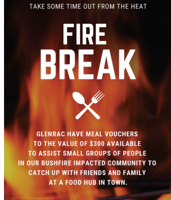
Glen Innes Natural Resources Advisory Committ