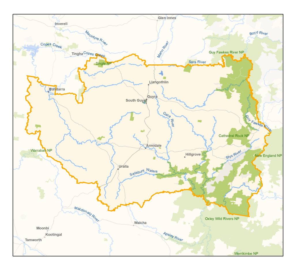
Northern Inland Koala conservation tender

bct.nsw.gov.au email: info@bct.nsw.gov.au | phone: 1300 992 688 f @NSWBCT @@NSW_BCT in @BiodiversityConservationTrust