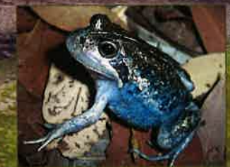
TIM RIG / ZS45