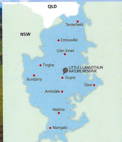
THE NEW ENGLAND TABLELANDS BIOREGION HAS 59 KNOWN WETLANDS CLASSIFIED AS ENDANGERED ECOLOGICAL COMMUNITIES

Little Llangothlin Nature Reserve covers 257 hectares and includes Little Llangothlin lagoon and a portion of Billy Bung lagoon. In 1996, the reserve was listed as a wetland of international importance under the RAMSAR convention. The lagoon is an important habitat for waterbirds, eels, freshwater turtles, frogs, snakes, swamp wallabies and kangaroos to name some of the key species calling the reserve home.