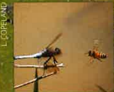
DRAGONFLIES FOUND ON THE LAGOON