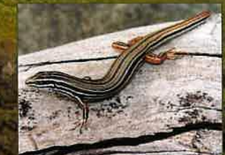
LITTLE LLANGOTHLIN NATURE RESERVE - MAIN & COVER - TERRY COOKE