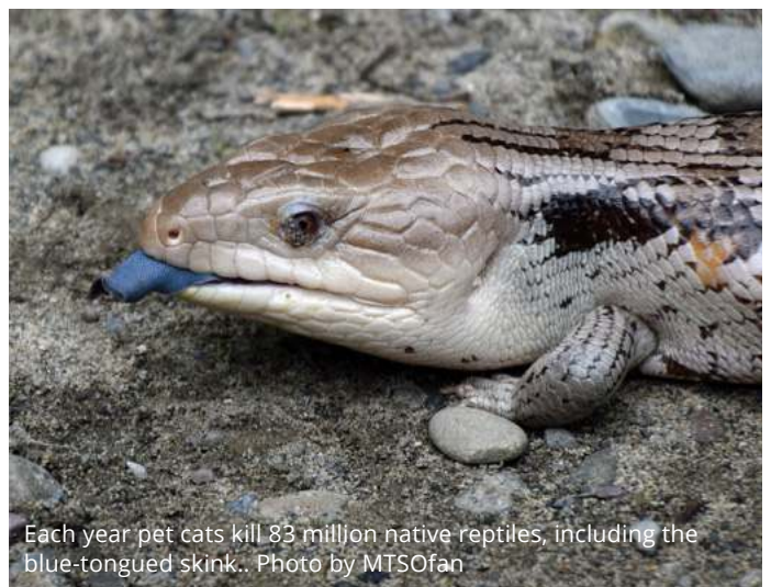
Each year pet cats kill 83 million native reptiles, including the blue-tongued skink..