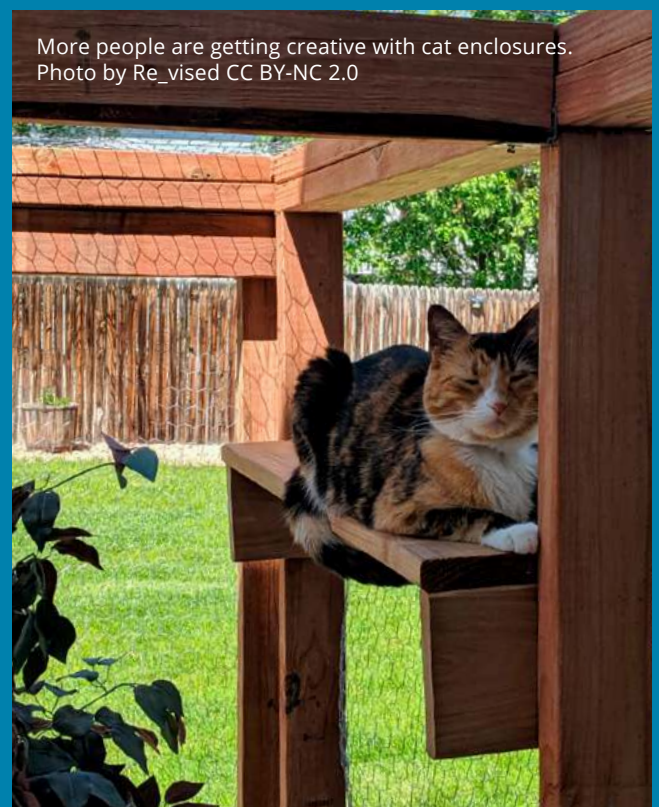
More people are getting creative with cat enclosures.

There is no equivalent capacity in NSW legislation to enforce cat containment currently, however, minor amendments to the Companion Animals Act 1998 could equip local governments with the necessary powers to consider cat containment at a local level.