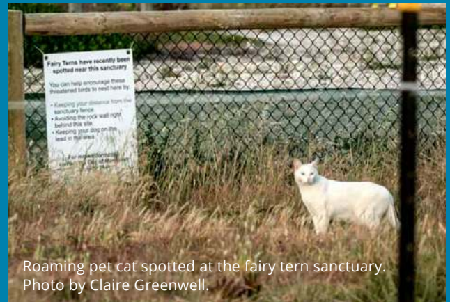
Roaming pet cat spotted at the fairy tern sanctuary.

A single free-roaming cat can detrimentally affect sensitive species – not only through direct predation, but secondary effects. In Mandurah, Western Australia, one unregistered, desexed male cat entered a protected breeding colony of fairy terns. Over a period of three weeks, regular predation and disturbance by the cat caused the complete reproductive failure of all 111 nests; 6 adults and multiple chicks were directly killed and the remaining birds abandoned their nests. The presence of one cat meant the bird colony failed to produce a single chick that made it to the end of nesting season 1 .