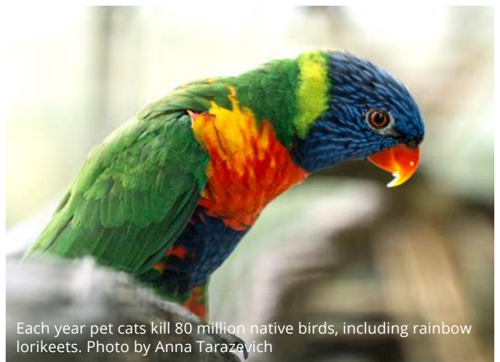
Each year pet cats kill 80 million native birds, including rainbow lorikeets.