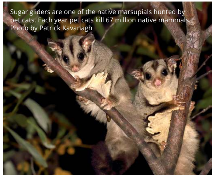
Sugar gliders are one of the native marsupials hunted by pet cats. Each year pet cats kill 67 million native mammals.