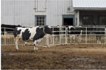
Example of livestock sliding segregating gate