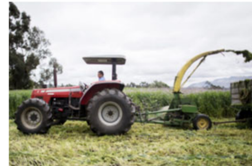
Example of rollover protection on a tractor