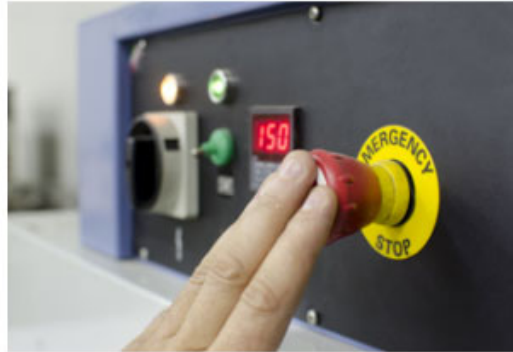
Example of emergency stop switch