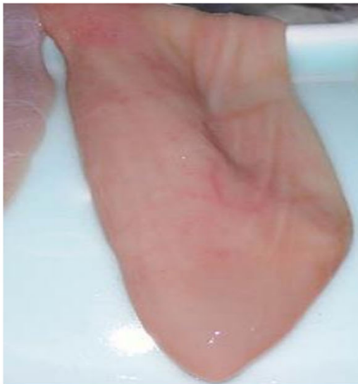
Healthy sheep intestine