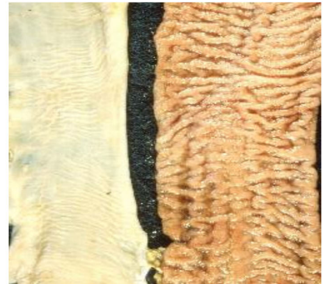
Johne's affected intestine